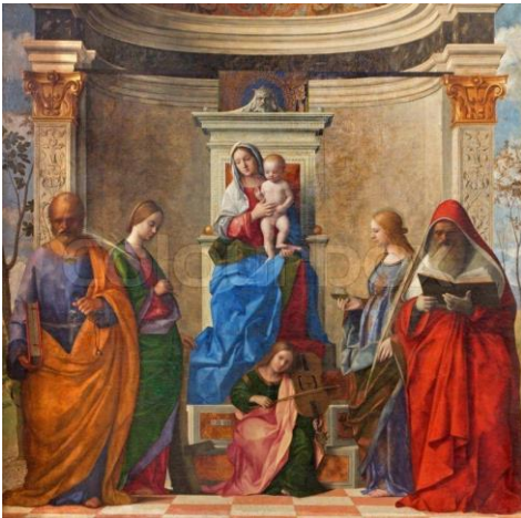
Giovanni Bellini, San Zaccaria Sacra Conversazione (1505), San Zaccaria, Venice