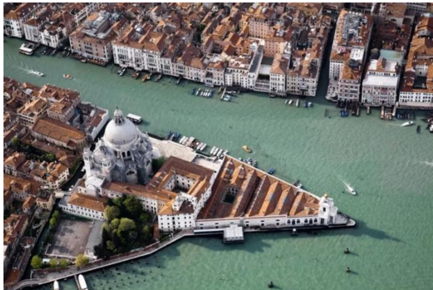
Punta della Dogana, 15th c., renovation by Tadao Ando, 2008 - 2009, Venice