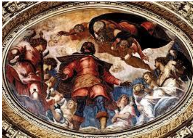
Tintoretto, Scuola Grande di San Rocco, The Glory of San Rocco , 1564 - 1588, Venice