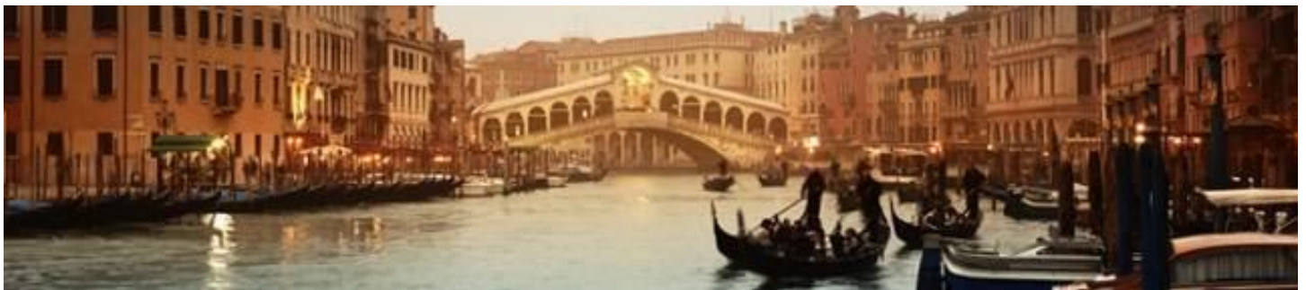
Grand Canal and Rialto Bridge in the distance, Venice

NOTE: Travellers are required to depart at the latest on Thursday, September 26 from the US and on Friday, September 27 from the UK or mainland Europe to arrive in Florence by Friday, September 27 for the beginning of the travel program.