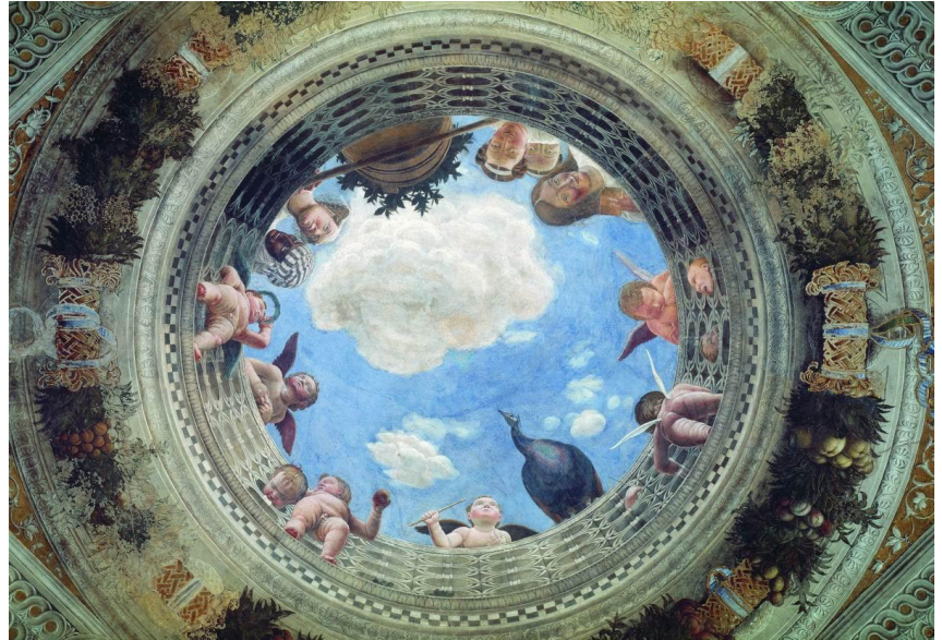
Andrea Mantegna - Ceiling Fresco at the Palazzo Ducale, Mantova