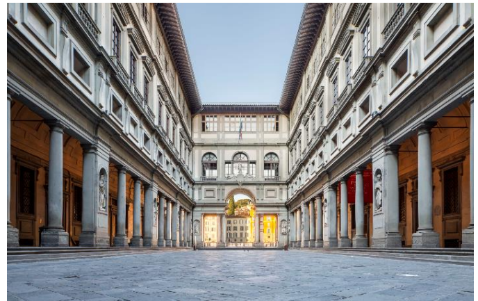
Uffizi Gallery, Florence

~ Firenze ~ Breakfast at Hotel Savoy Church of San Lorenzo and the Medici chapels Visit to the Uffizi Gallery, which includes Sandro Botticelli, Cimabue, Michelangelo, Giotto, Leonardo da Vinci, and Raffaello. Optional cooking class or free time for shopping Dinner at leisure Accommodation: Hotel Savoy Florence (5*) Meals: breakfast