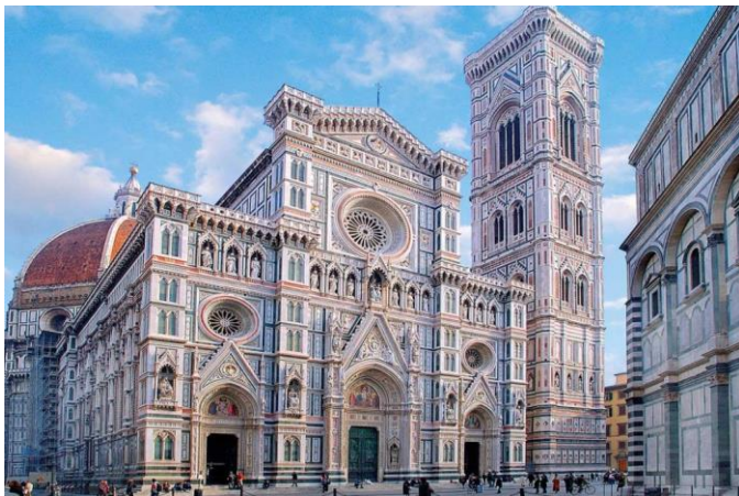
Cathedral of Santa Maria del Fiore in Florence

~ Firenze ~ Breakfast at Hotel Savoy Private visit of Cathedral of Santa Maria del Fiore and Museum of Opera del Duomo Santa Maria Novella: Masaccio, Holy Trinity Lunch and private collection visit Return to hotel Dinner Accommodation: Hotel Savoy Florence (5*) Meals: breakfast, dinner