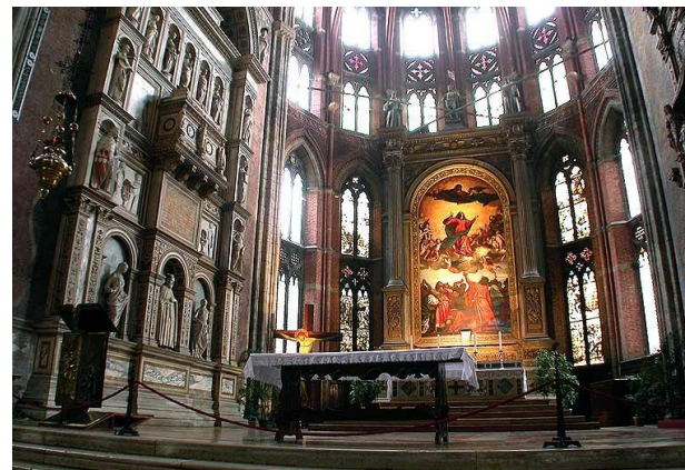
Titian, Assunta , 1516 - 1518, Basilica di Santa Maria Gloriosa dei Frari, Venice