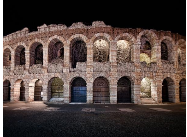
Verona Arena, Verona

Day 7: Thursday, October 3 ~ Verona e Mantova ~ Breakfast at Hotel Accademia Private coach trip to Mantova (45-minutes) Castello San Giorgio: Andrea Mantegna, The Court of Gonzaga, Camera degli Sposi Palazzo Ducale: Andrea Mantegna, The Picture Bearers Lunch in Mantova Return to Verona (45-minutes) Home of Juliet of Romeo and Juliet Verona Arena and private visit to Casa Museo Palazzo Maffei Dinner at leisure Accommodation: Hotel Accademia (4*) or Hotel Due Torri (5*) Meals: breakfast