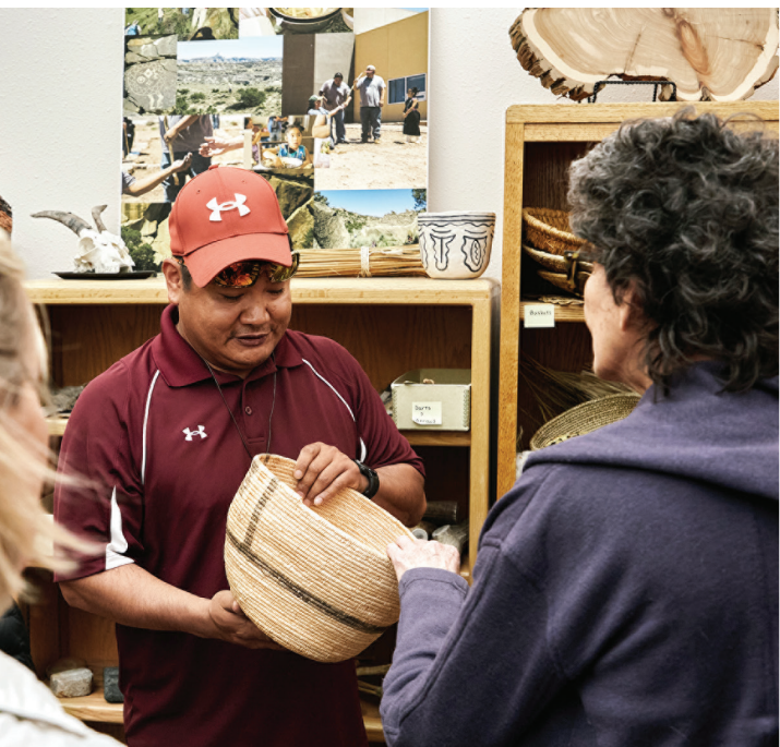
Right: Jemez Pueblo

The Friends of Archaeology endowment funded the production of the quarterly newsletter as well as programming and staff development.