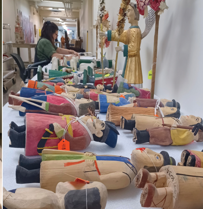
Left:  Right: