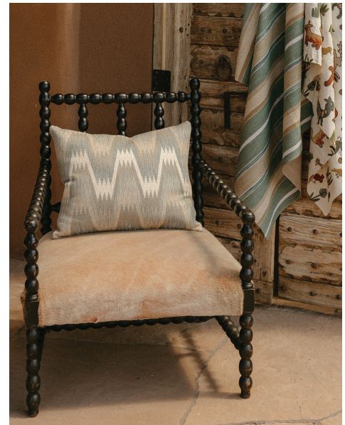
Fabrics from the Folk Art Collection by Kravet Fabrics.