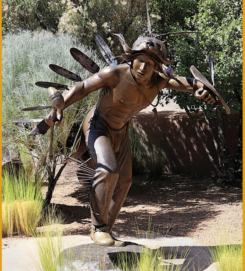
Bear Dancer by Eddy Shorty (Diné) welcomes visitors to the Museum of Indian Arts and Culture.

The long-range project will unfold in phases. Restoration efforts began last fall as a crew from Ancestral Lands, an initiative engaging Native youth in land stewardship, cleared trails and underbrush in the arroyo to reduce fire risk. Their efforts reflect the intergenerational care that sustains cultural landscapes. "Through Ancestral Lands, I learned how our teachings live in the land," notes one participant.